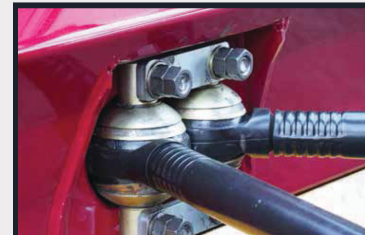
No grease All linkages are sealed for life