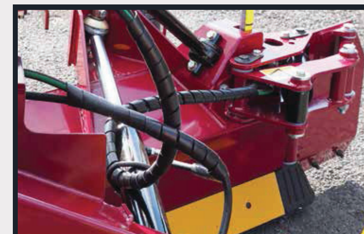
Best in class visibility of the cutting edge