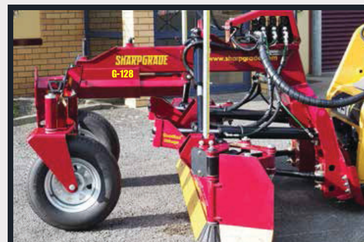
Retracting front chassis for reduced transport length