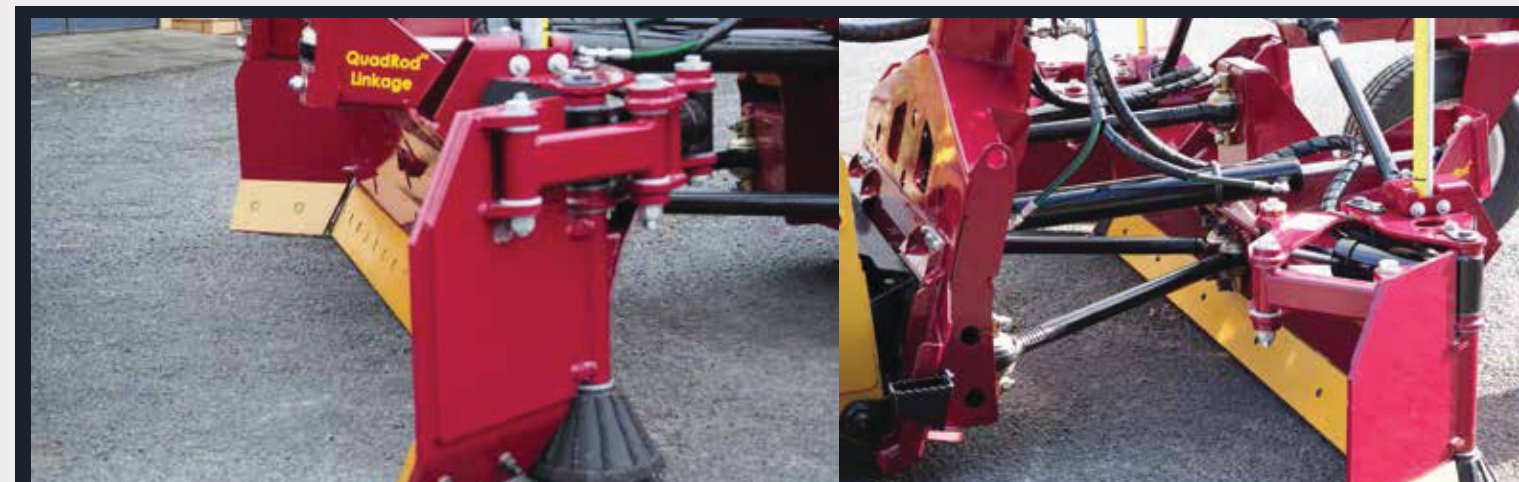
Cut, carry or windrow material forward or backward with double acting wings & rear blade